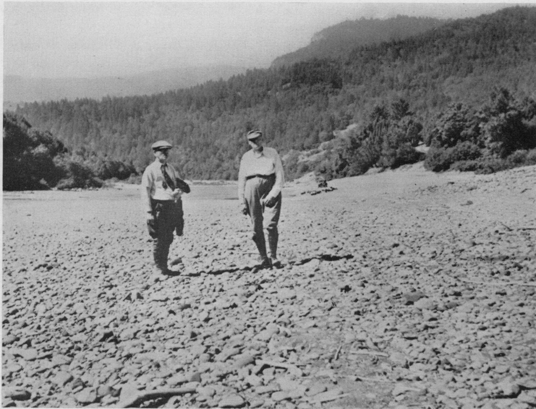
FIGURE 2—Wide, gently sloping beach between high and low water levels on Rogue River near the mouth of the Illinois.