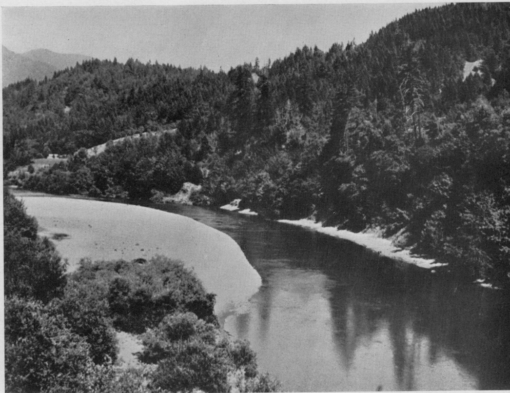
FIGURE 3— Crescent of river above bridge at Agness showing beach with sharper bank at low-water level