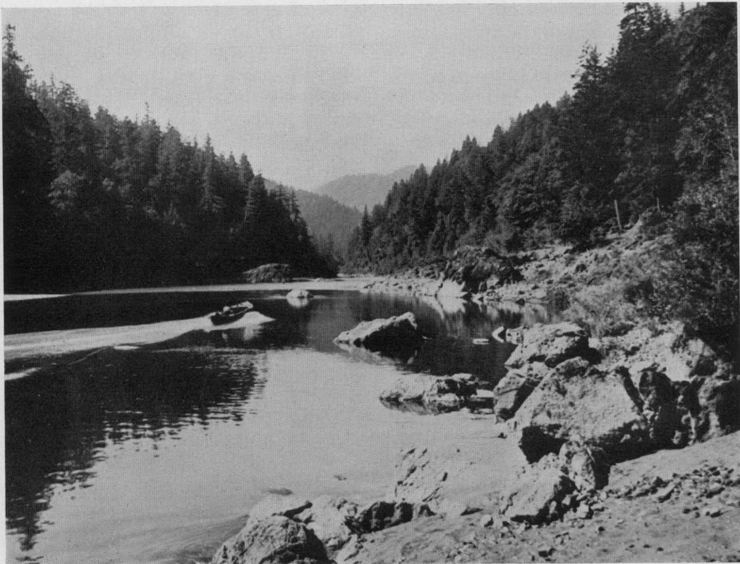
FIGURE 6— Scattered rocks along shore with bed of sand in right foreground.