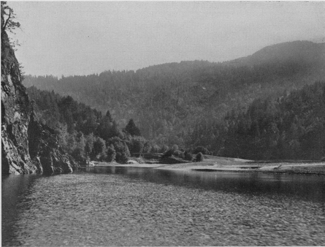
FIGURE 1—View of riffle where one crescent of river connects with the reversed crescent next below.