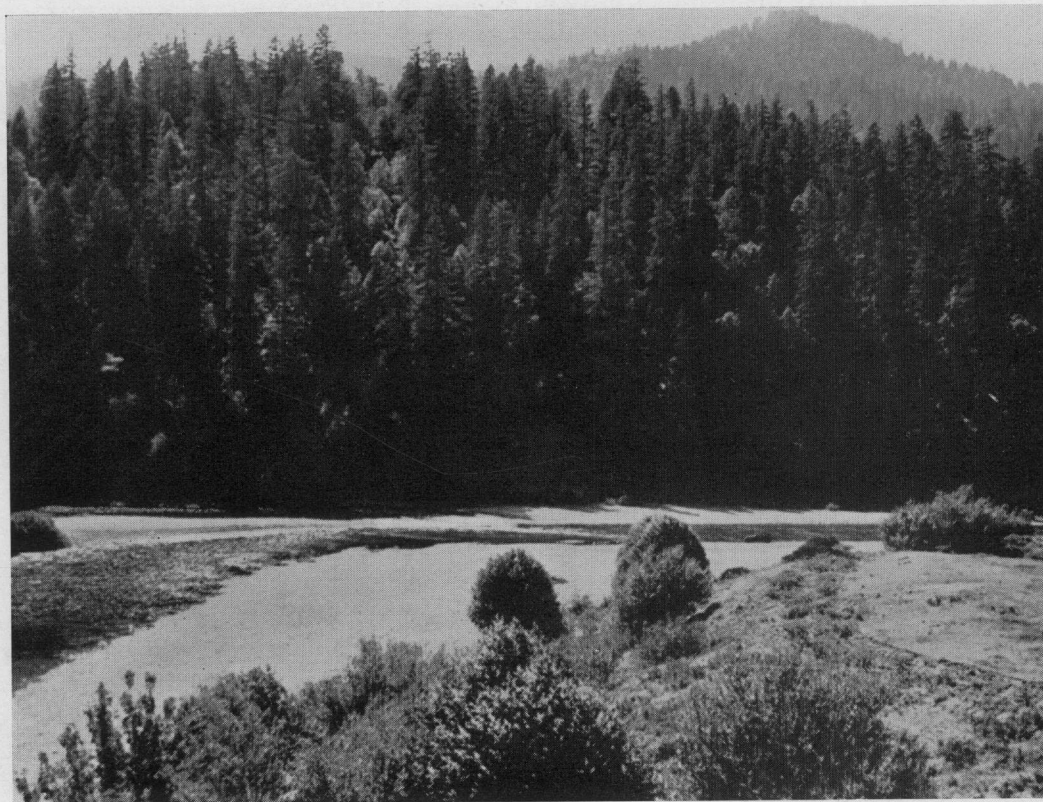
FIGURE 4— Crescent with longitudinal bar of coarse gravel on outside of curve and higher rocky bank with vegetation inside curve. Taken at junction of Rogue and Illinois rivers.