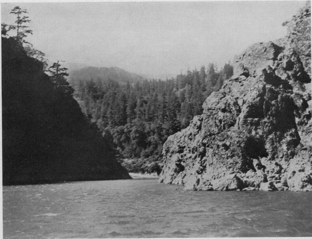
FIGURE 5— Bold rocky promontory. Rock marked by color of thin layer of deposit below high-water level.